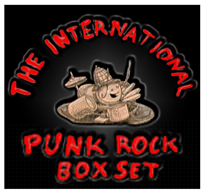
"The International Punk Rock Box Set"