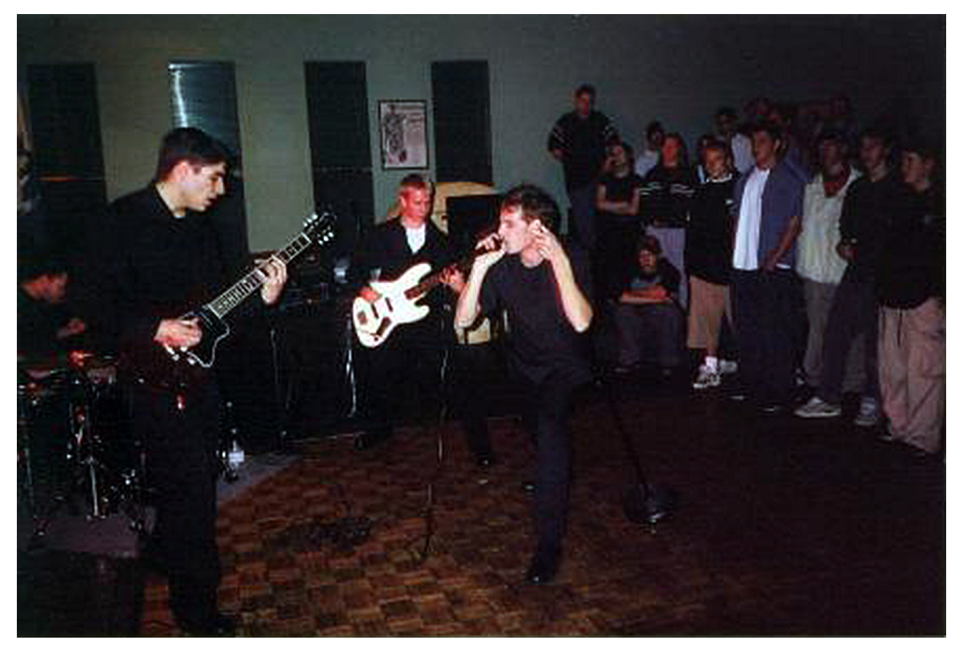
The Sneak Preview at their first real show, September 30th 2000 at The Masonic Lodge in Maple, Ontario.