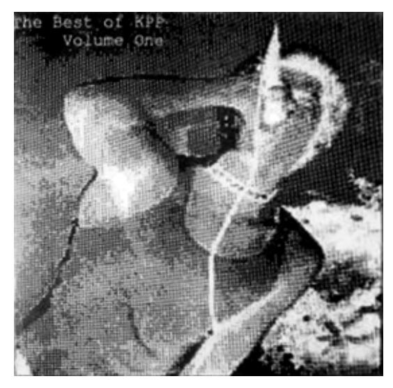
"The Best of KPP Volume 1" compilation, Kingston Punk

On September 8th they played at Hamilton's Transit Union Worker's Hall with Silverstein, Boys Night Out, Bayside, The Pettit Project, Handheld, The Thugz, and The Spozedas. Later that month they opened up for Smakin' Isaiah and Layaway Plan at Grill One in Brampton.