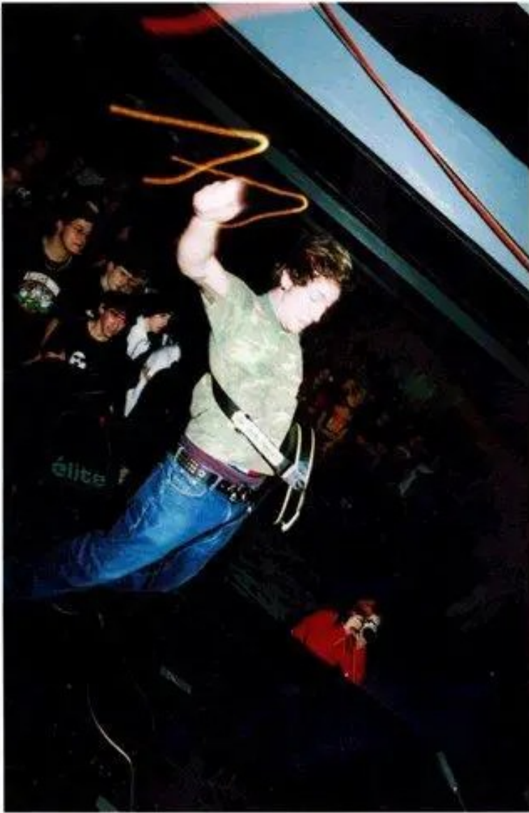
The Separation Suicide playing at L'Anti in Quebec City. Date and photographer unknown