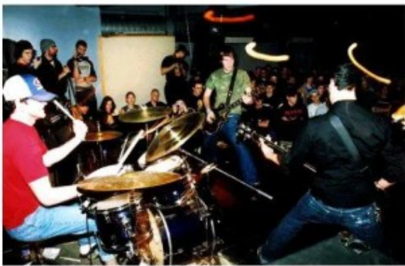
The Separation Suicide playing at L'Anti in Quebec City. Date and photographer unknown