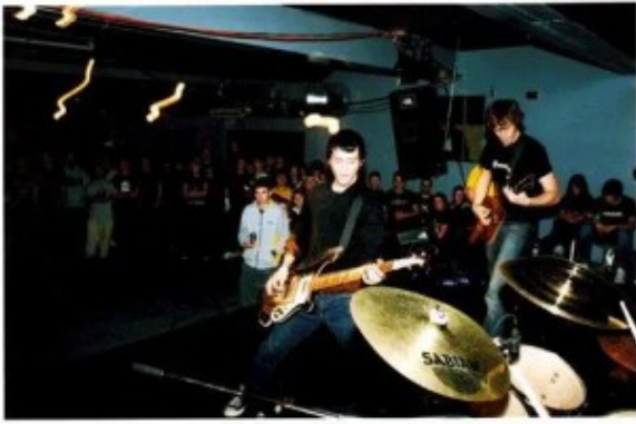
The Separation Suicide playing at L'Anti in Quebec City. Date and photographer unknown