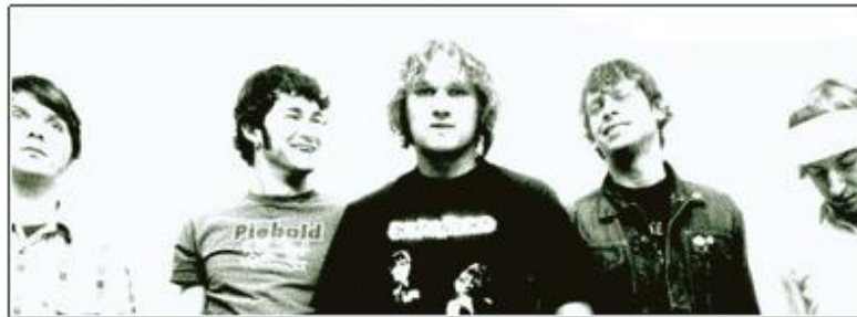
The Separation Suicide photoshoot taken in early 2003 for the promotion of "This Conversation".