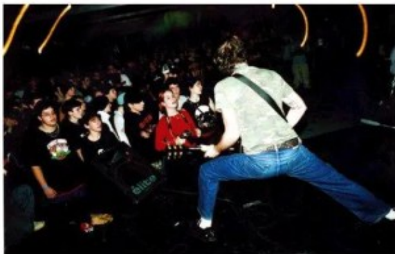
The Separation Suicide playing at L'Anti in Quebec City. Date and photographer unknown