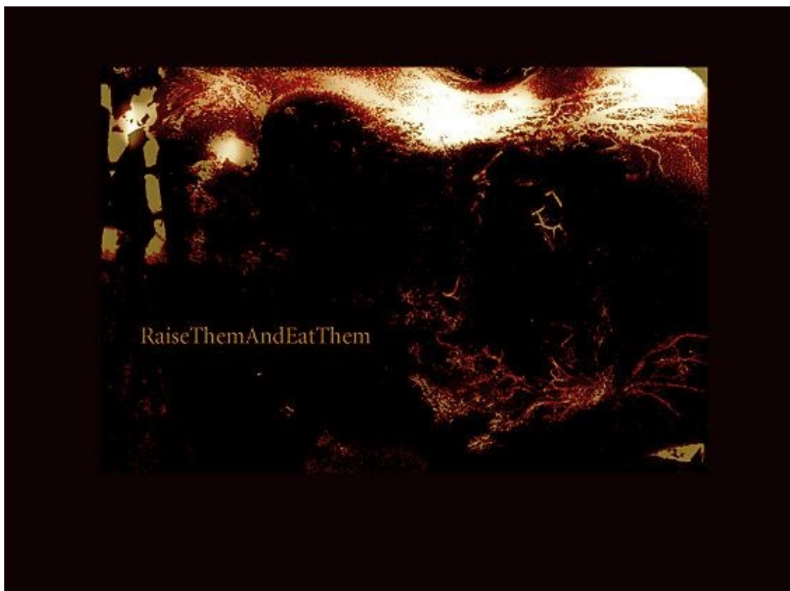
Image used for "Chapter #1: The Omnipotent Failure", prior to having any band pictures.