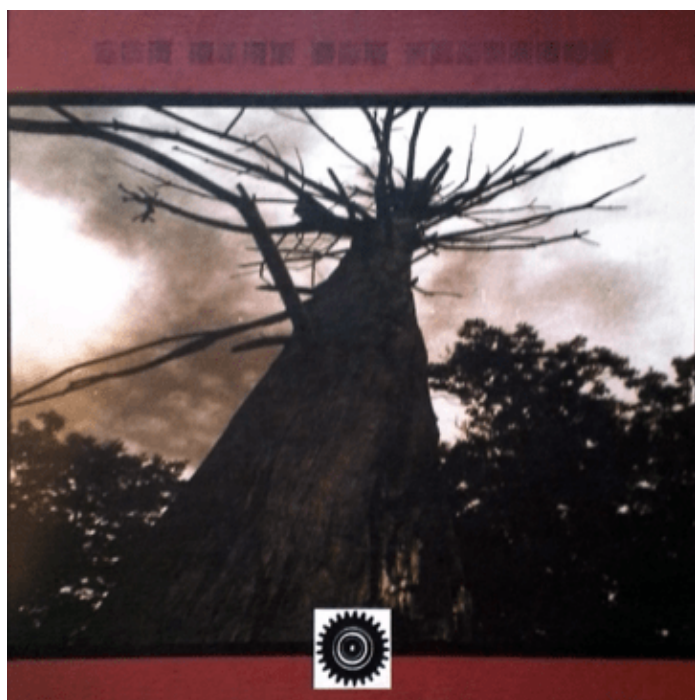
One Eyed God Prophecy 12" LP, first pressing on The Great American Steak Religion, 1996