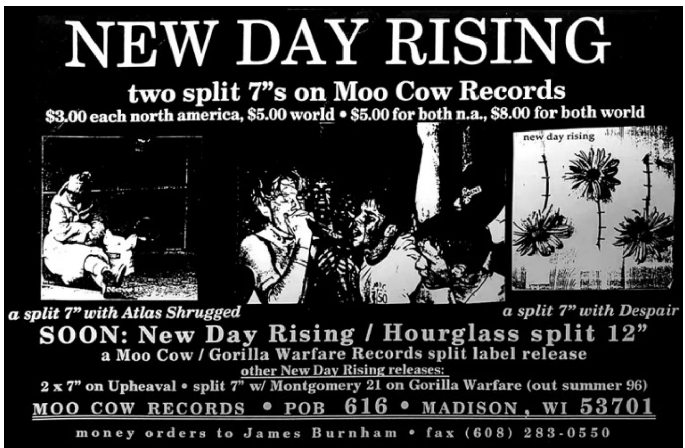
New Day Rising Ad 1996