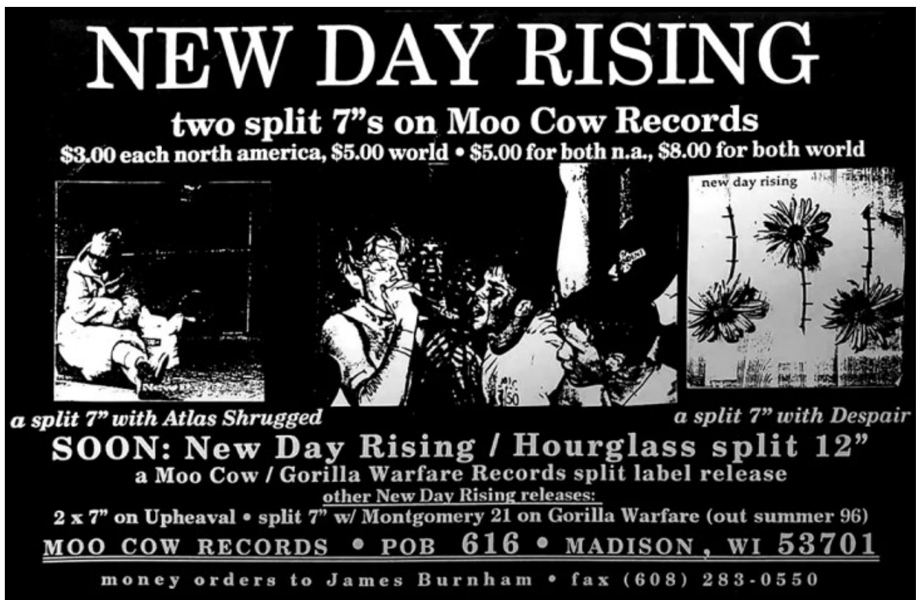
New Day Rising Ad 1996