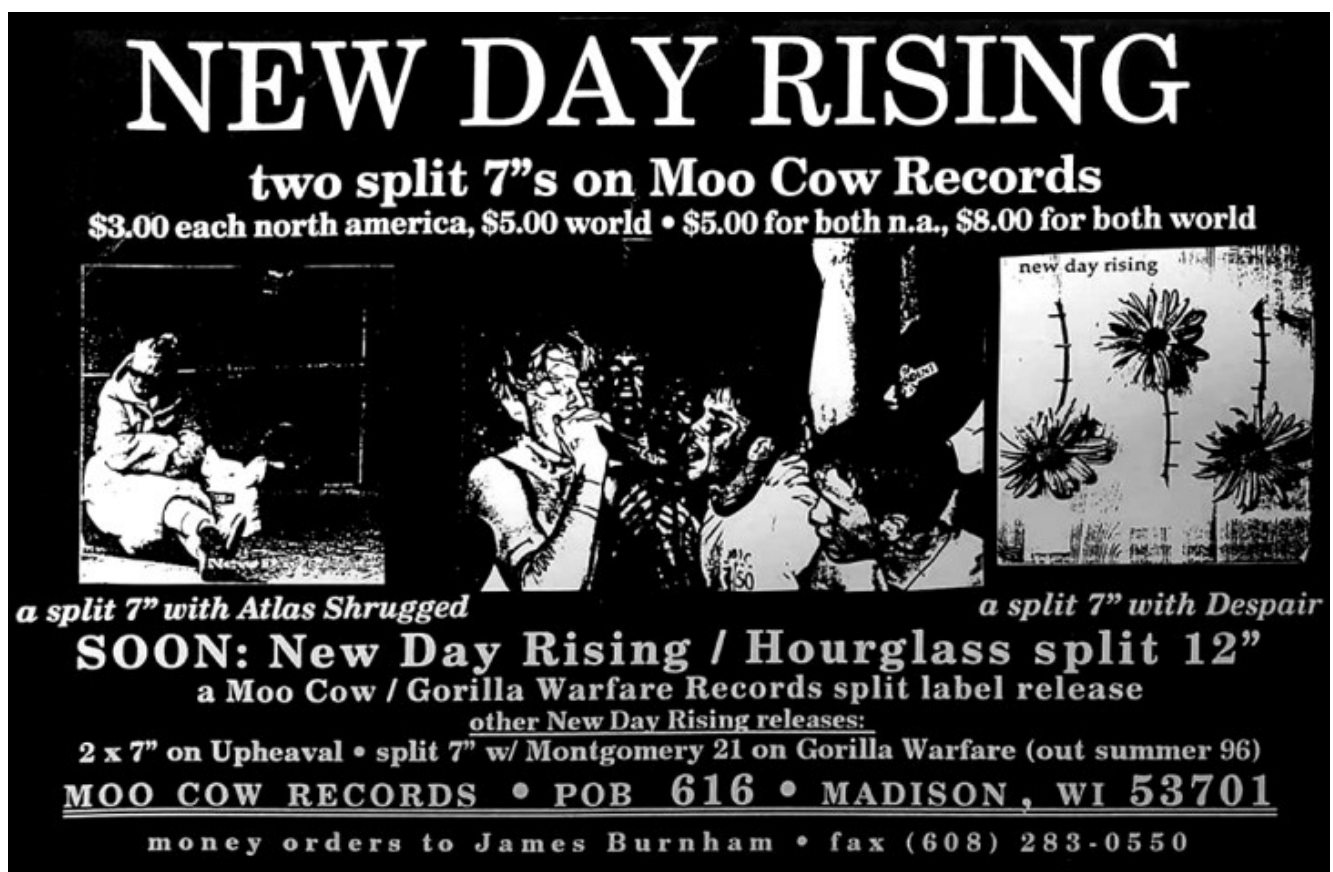
New Day Rising Ad 1996