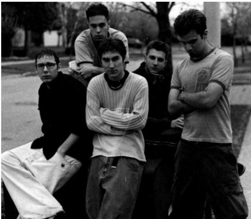
Louis Mistreated's second photoshoot, 2001