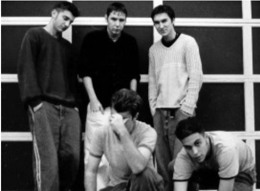
Louis Mistreated's second photoshoot, 2001