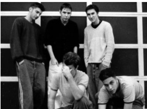
Louis Mistreated's second photoshoot, 2001