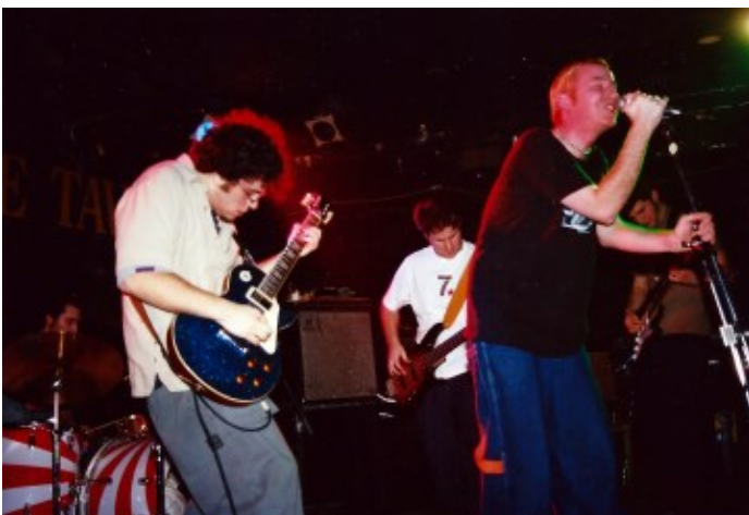
Louis Mistreated performing at the Horseshoe Tavern on January 23rd 2002, opening for The Gloria Record

2002 would feature less shows by the band but not less in quality. To start out the year, Louis Mistreated got to play with one of their hero, The Gloria Record, at the Horseshoe Tavern on January 23rd 2002. Although The Gloria Record was meant to be supported by Her Space Holiday during their first of three North American tours in 2002, the band couldn't make it across the border for the three Canadian shows. Leaving Louis Mistreated to open up directly for The Gloria Record! LM ended up partying with TGR backstage and garnered one of the only mention of any opening bands in Gloria Record's tour diary. They were asked to open up for The Gloria Record again