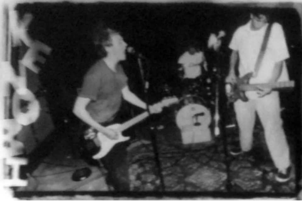
Kenobi