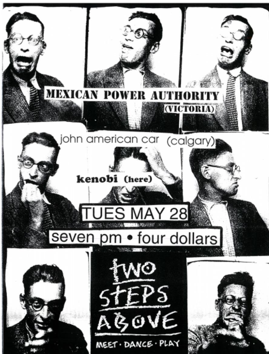
Kenobi performing at Two Steps Above on May 28th 1994 with Mexican Power Authority and John American car