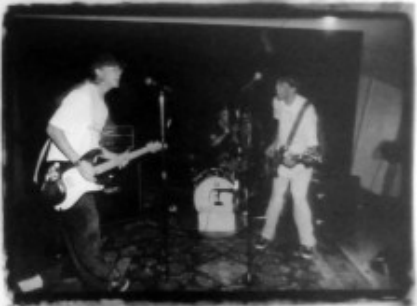
Kenobi