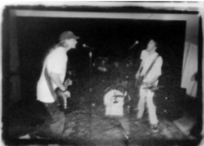
Kenobi