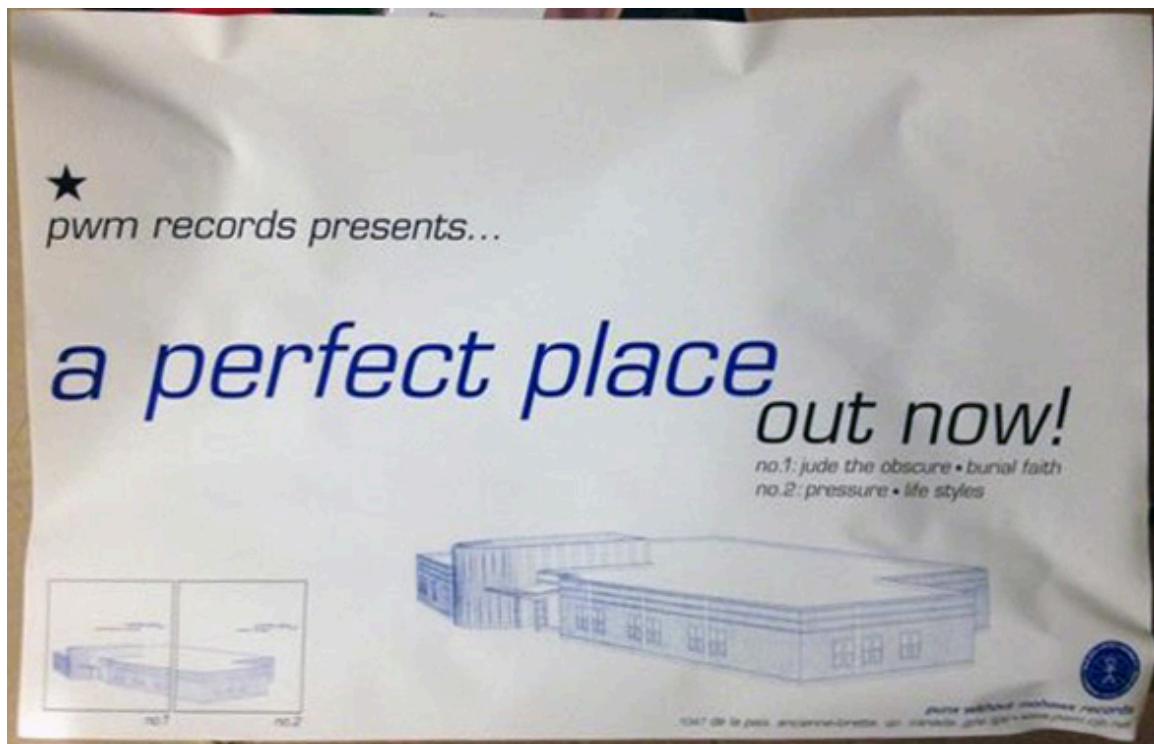
Poster advertising "A Perfect Place" on Punx Without Mohawx Records