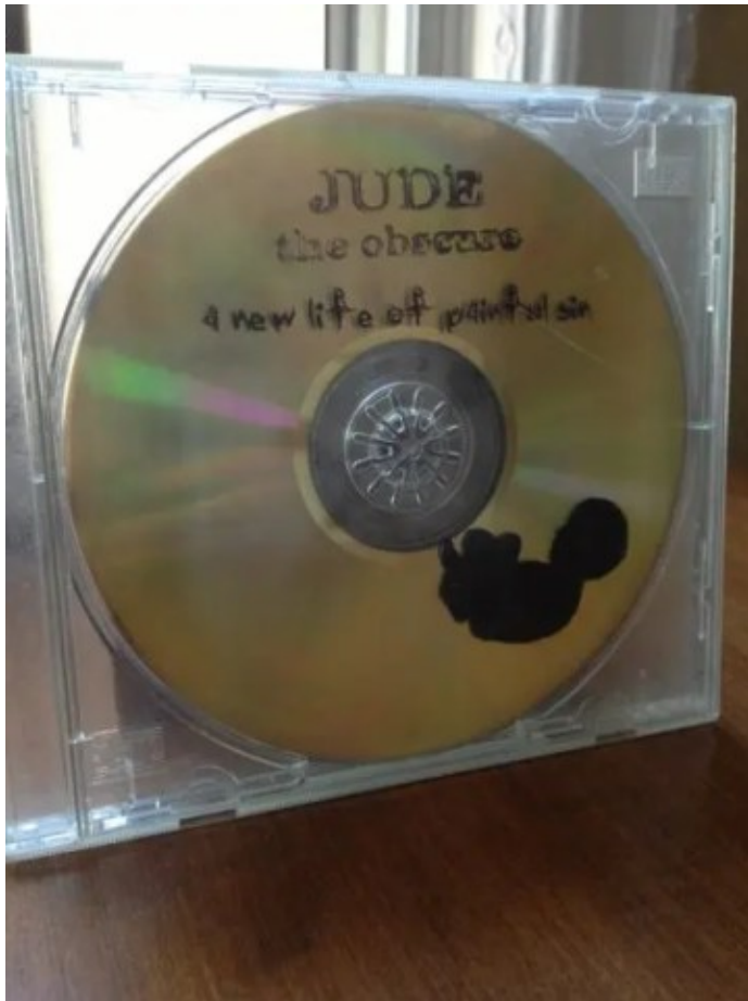
"A New Life of Painful Sin" demo, 1999