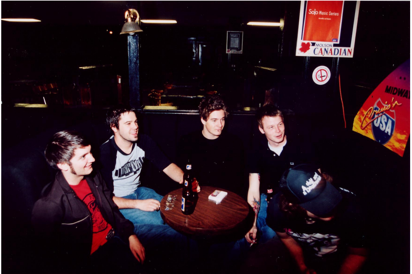
Jude the Obscure, circa 2003