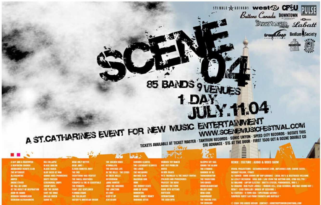
SCENE Music Festival 2004 flyer