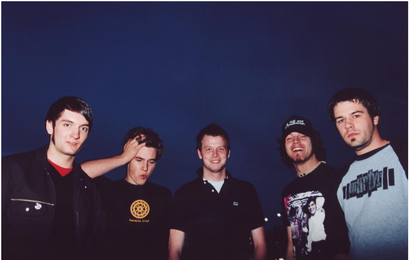
Jude the Obscure, circa 2003