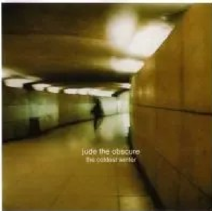
“The Coldest Winter”, October 2003, Defiance Records