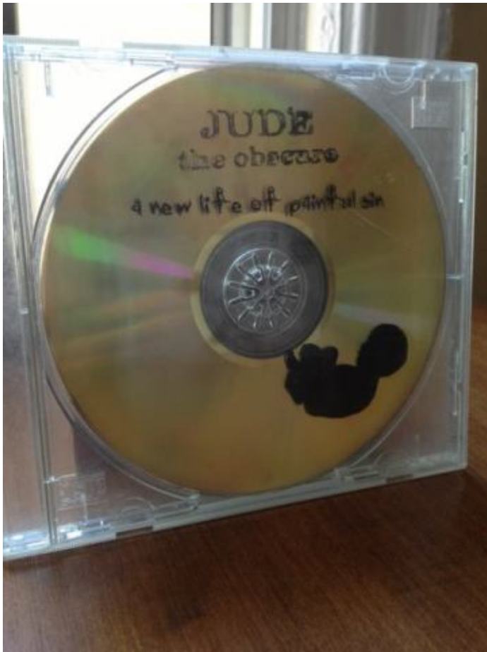
"A New Life of Painful Sin" demo, 1999