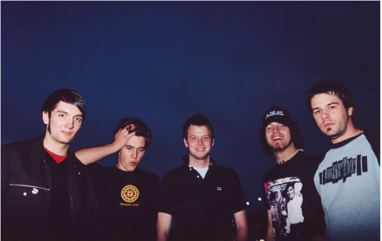
Jude the Obscure, circa 2003