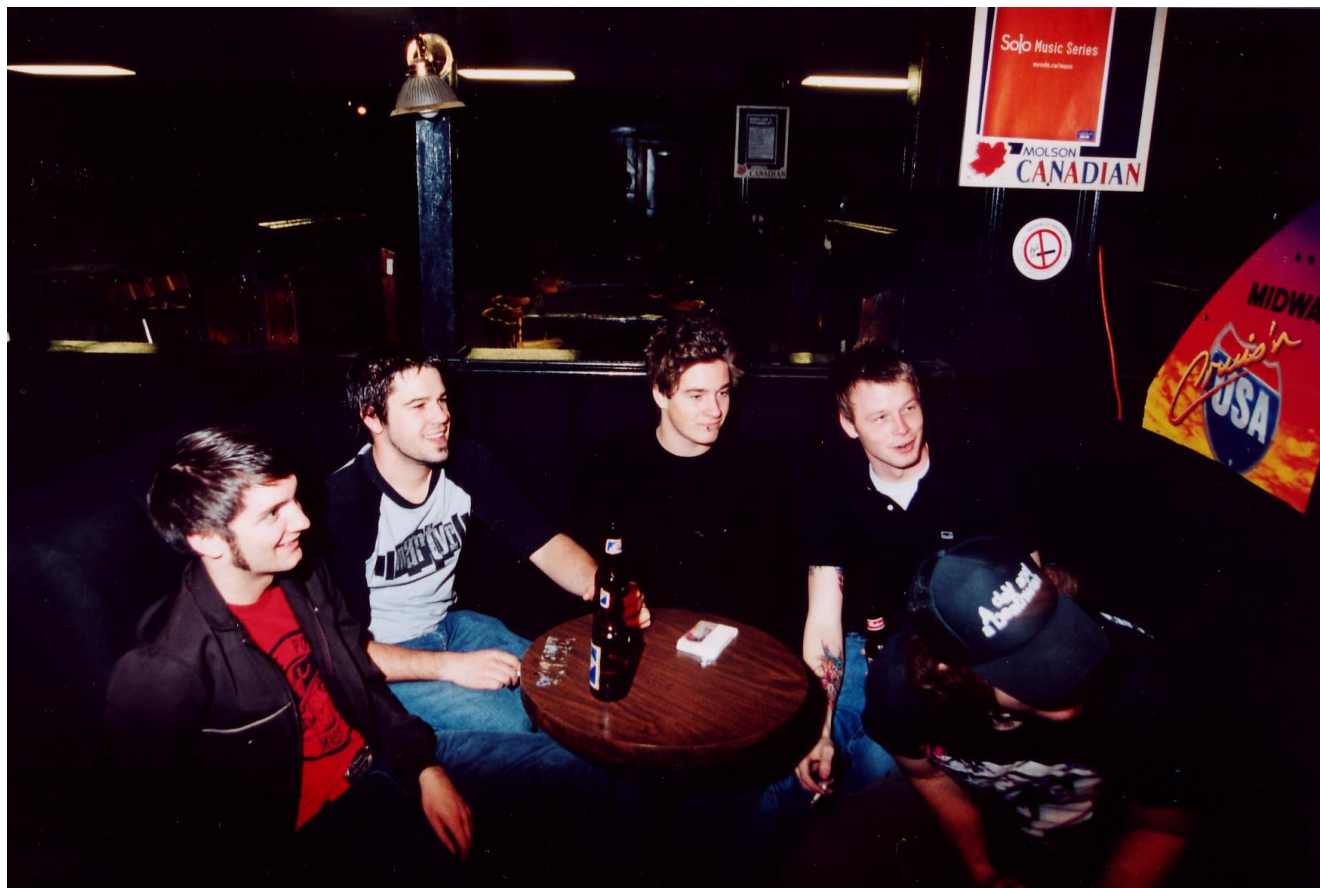
Jude the Obscure, circa 2003