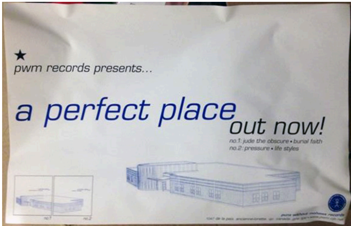
Poster advertising "A Perfect Place" on Punx Without Mohawx Records