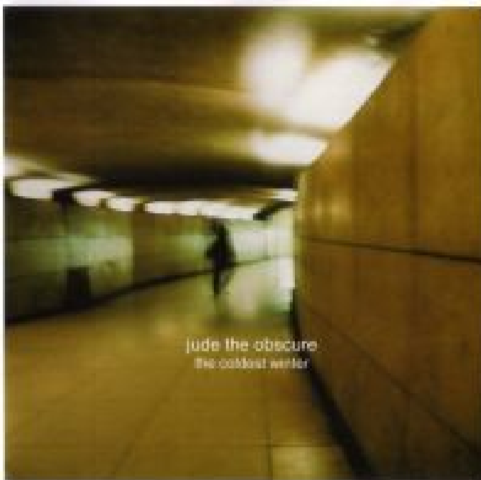
“The Coldest Winter”, October 2003, Defiance Records