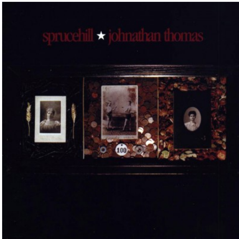
Split CD with Sprucehill, Fallen Tree Recordings, summer 1996