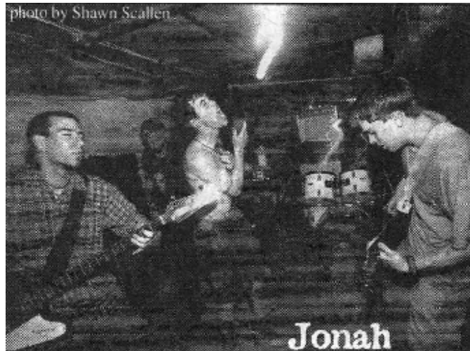
Jonah, circa 1996

Jonah was one the cult hardcore bands from Quebec in the mid 90s. They certainly hold their place in the top most important Quebec bands and I'm happy to finally shed some light on this gem.