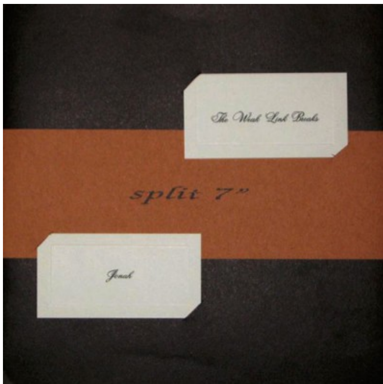
Jonah split with The Weak Link Breaks, Bug Records, 1997