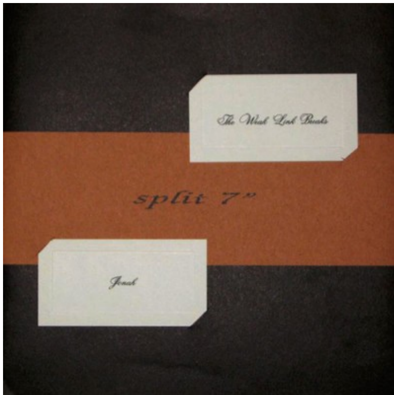
Jonah split with The Weak Link Breaks, Bug Records, 1997