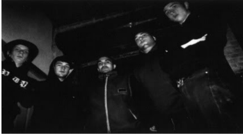
In This Defiance, first line-up and possibly first band picture, circa May 2005