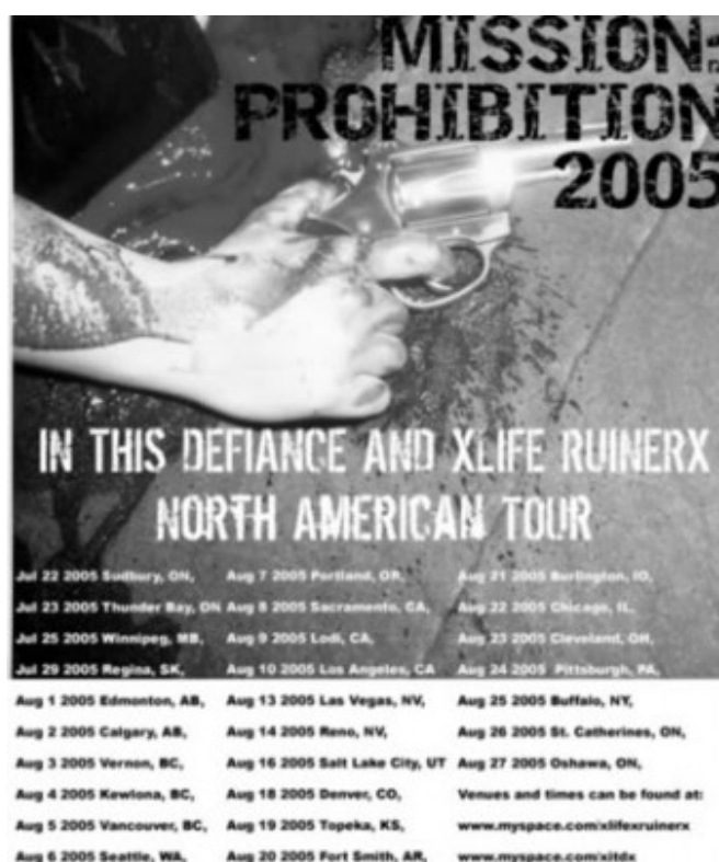
Mission: Prohibition Tour 2005. In This Defiance's first tour with Liferuiner

they were able to jump on a matinee show with Terror, First Blood and Piece by Piece, in which the band fitted perfectly. Later that night they booked a second show in Ventura, California with Youth Attack. Other events such as the August 16th show in Salt Lake City, Utah were parking lot shows in front of a pizza shop called "The Wild Mushroom".