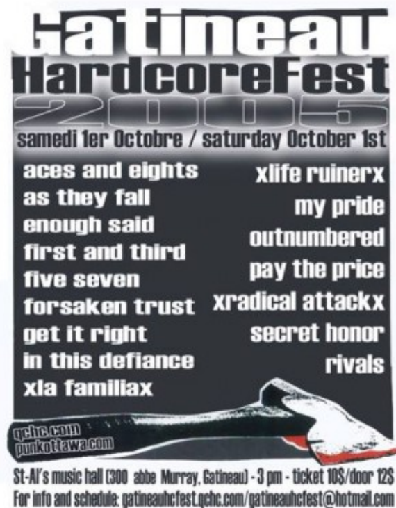
Gatineau Hardcore Fest, Saturday October 1st 2005