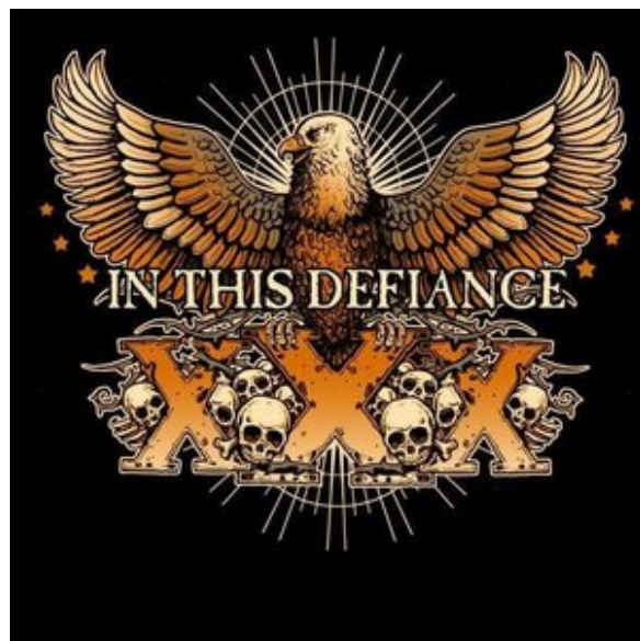
In This Defiance's tentative album cover for "Vei Victus"