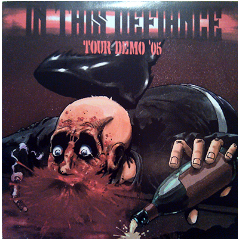
In This Defiance's first demo, "Tour Demo 05", with the first artwork.

They quickly recorded the first 3 songs they had written at a small home-based studio in London in four hours. One of their friend designed the artwork and it was off to the press. The band got the first CD pressing of 1000 copies just in time for their first tour, "Mission: Prohibition" with Liferuiner, in July. The band had also silk screened a bunch of t-shirts before leaving, right in their jam space. In This Defiance was actually invited to play the first Straight Edge Fest in July 2005 but couldn't make it due to van trouble. The tour lasted over a month, from July 22nd 2005 to August 27th 2005 and took the bands from Ontario, all the way in the western provinces, down the US west coast, through the western states to the midwest, and coming back up to Ontario through Pennsylvania and New York. For a band that had only been around for five months, it was a hefty undertaking that made a mark in the hardcore scene. The tour had minor suffering from dropped shows and double booking, but some of the best moments resulted from this. When they found out last minute that their August 10th show in Los Angeles, California had been canceled,