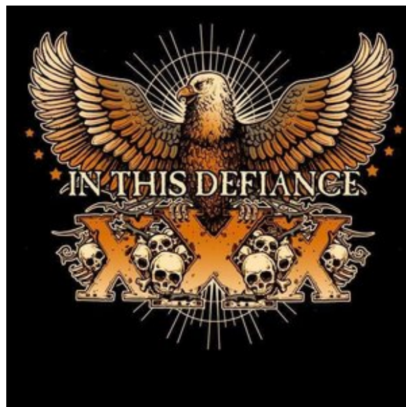
In This Defiance's tentative album cover for "Vei Victus"