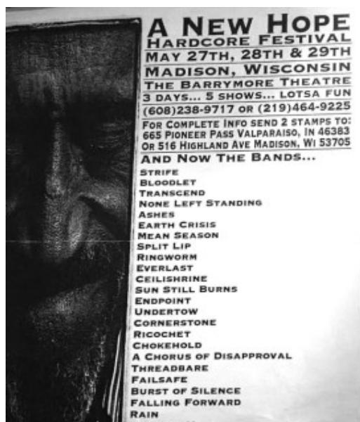
A New Hope Hardcore Festival, Madison, Wisconsin. May 27th – 29th 1994.