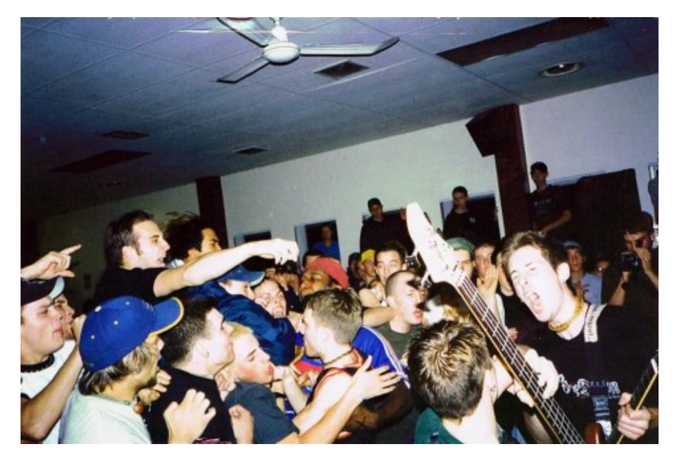
Confine playing in Oakville.