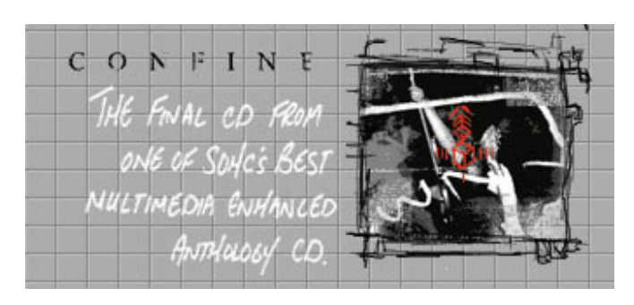
Re-Define Records ad for the Confine discography, circa 2001