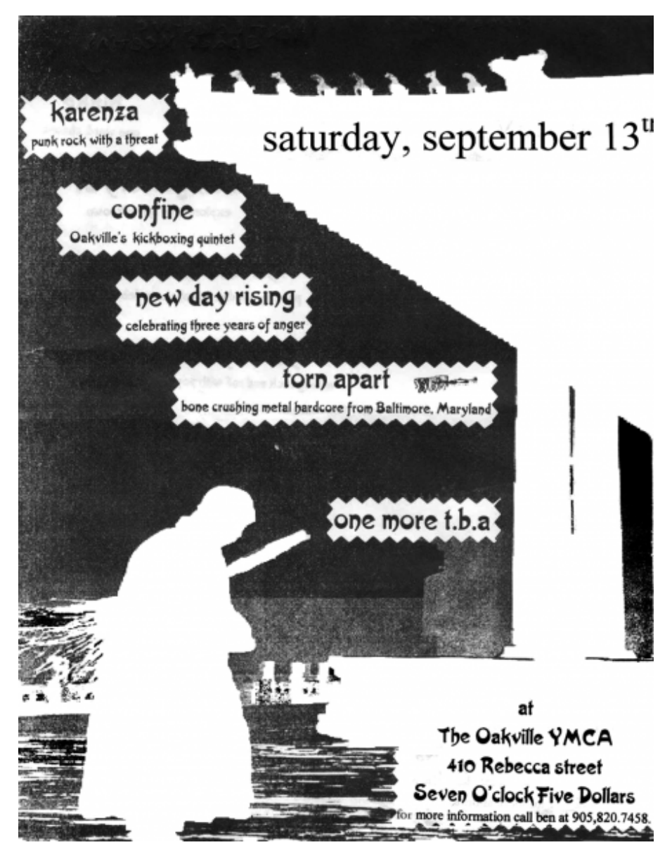
Confine show on September 13th 1997 at the Oakville YMCA with Karenza, New Day Rising and Torn Apart