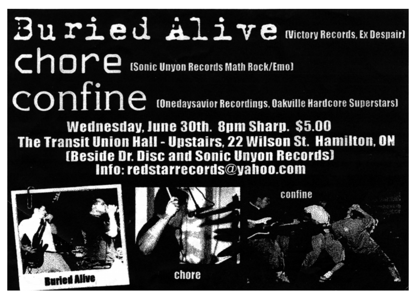
Confine show on June 30th 1999 at The Transit Union Hall in Hamilton, with Buried Alive and Chore

Quebec. All those shows went great. However by the time they crossed over the border, things started to get worse. The tour was meant to be with Spread the Disease and Poison the Well, but with the loss of one of their guitarist, headliner Spread the Disease didn't go. Most of the US shows were cancelled or lacked spectators due to their absence. The only two US dates that were played were Rochester and Syracuse. On October 9th 1999, Confine play at the Oakville Octoberfest.