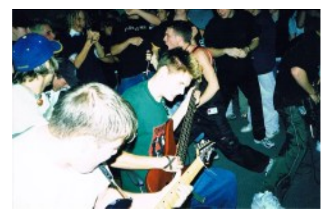
Confine playing in Oakville.