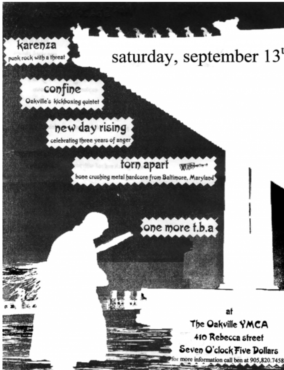
Confine show on September 13th 1997 at the Oakville YMCA with Karenza, New Day Rising and Torn Apart