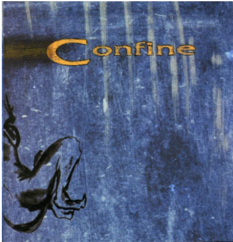
Confine "The Beginning of the End", OneDaySavior Records, July 16th 1999