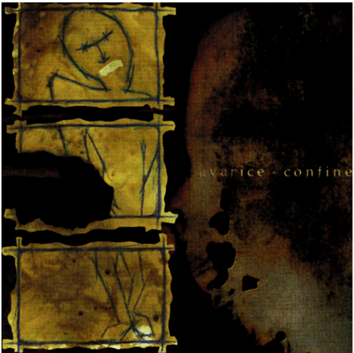
Avarice and Confine split, Redstar Records, summer 1998