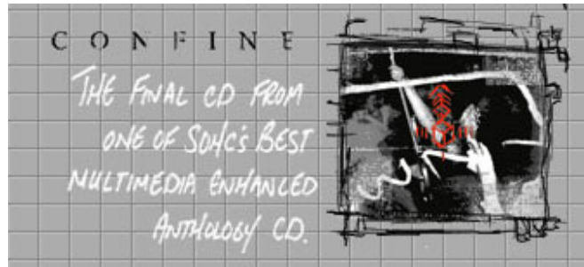
Re-Define Records ad for the Confine discography, circa 2001