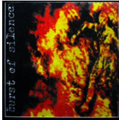
Artwork of what would have been Burst of Silence's full-length album "Burning" in 1994