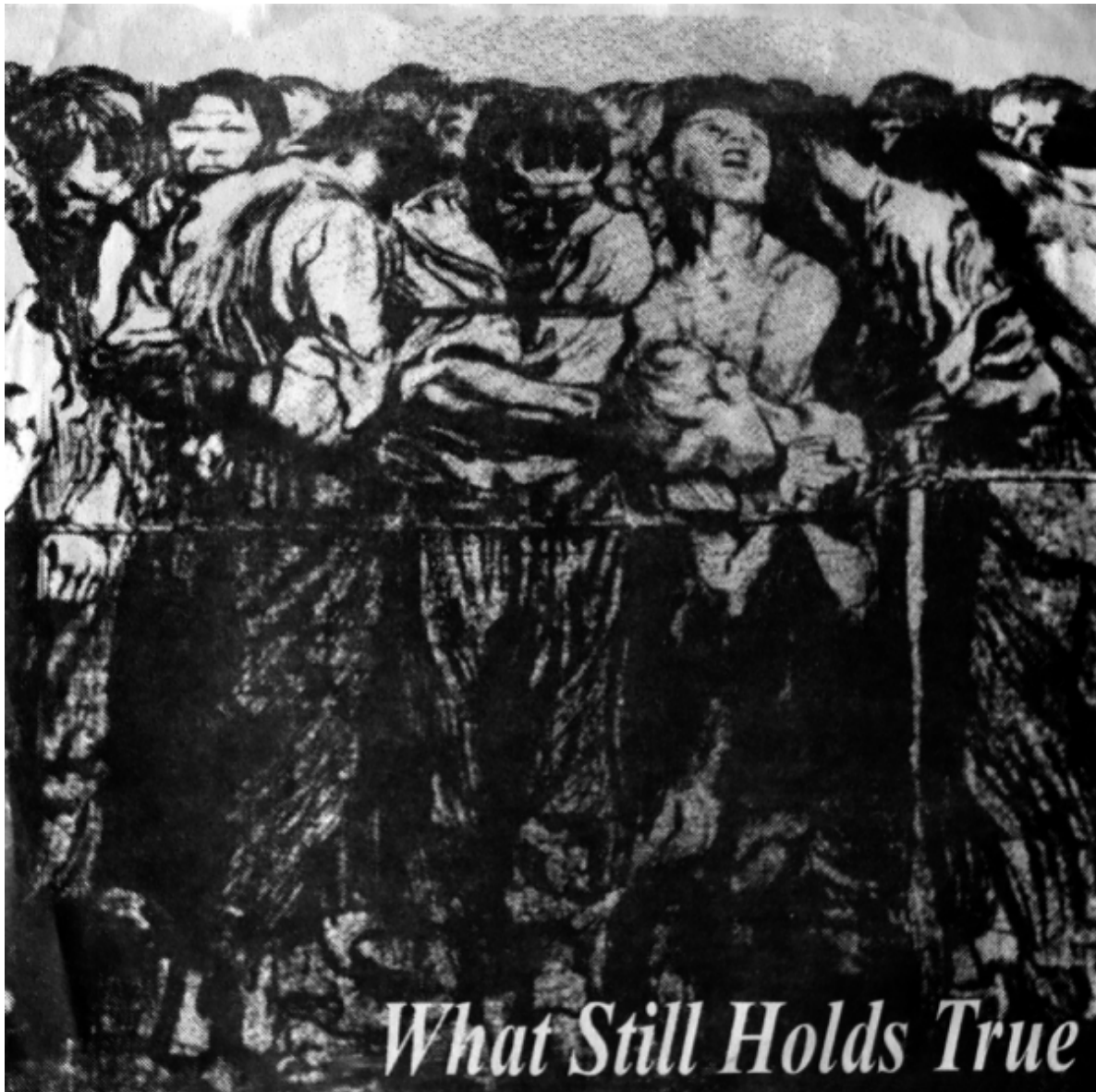
"What Still Holds True" compilation by Holdstrong Records, featuring Burst of Silence, 1994