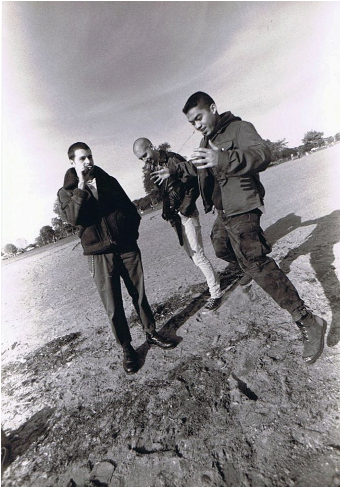
Blundermen, circa 1993