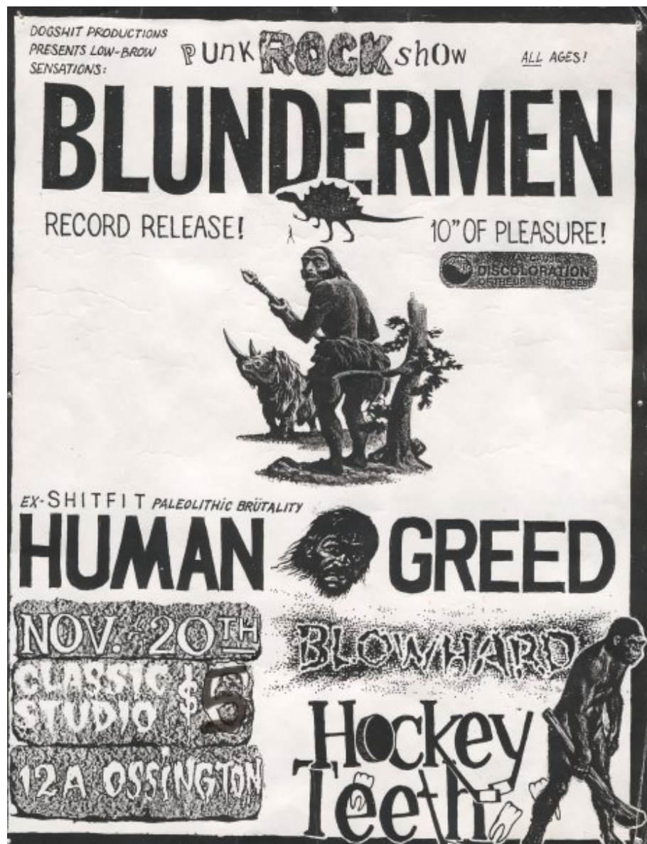
"Blunder on Bikini Island" release show on November 20th 1993.

1994 followed by the CD edition in 1995. Their album "Blunder on Bikini Island" ended up coming out in late November 1993, on 10" vinyl and cassette tape. The vinyl featured 7 songs, while the tape edition added their cover of 4 Skin's "Chaos". This mentioned cover would also be included on a later Fans of Bad Productions Records compilation, "GO!", which was released in 1997 on vinyl and 1998 on CD. The version of "Chaos" on "GO!" somehow got slowed down during the mastering process for the compilation (apparently Eva from Wad said their song had the same problem). But the version on the tape version of "Blunder on Bikini Island" remains at the correct speed.