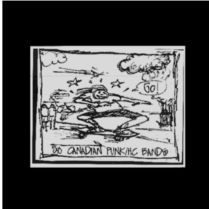
"GO!" compilation by Fans of Bad Productions Records. Released on LP in 1997, CD in 1998.

weren't ready in time, the band quickly put together 19 pre-release record covers, each were different, for that night.