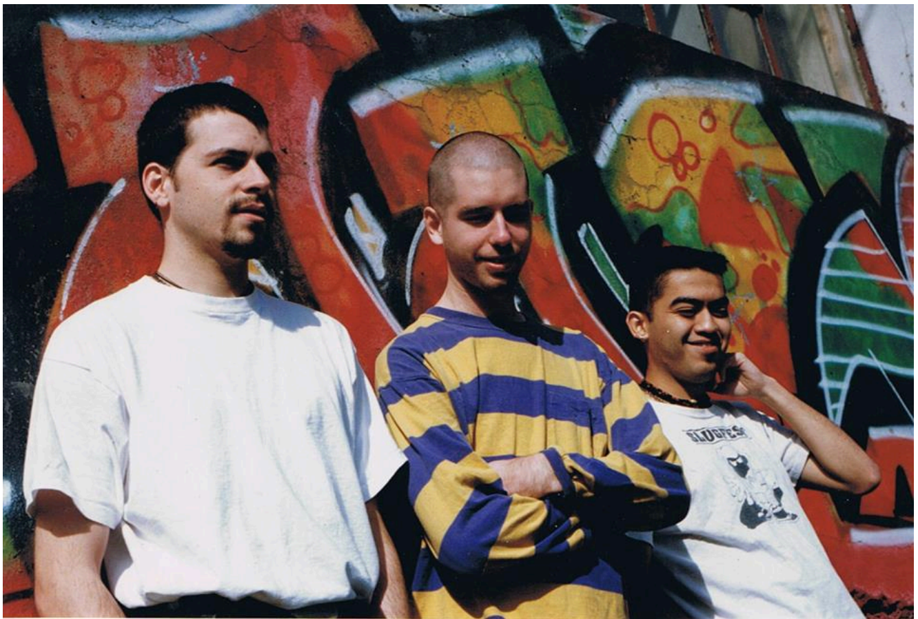
Blundermen, circa 1993

at the Blunderhouse), General Fools, Human Greed, and 84-78. Their Ontario partners-in-crime included: Hockey Teeth, Blowhard, Wad, Phallocracy, Mr. Nobody, No Man's Land, Chokehold, Crumble, Shotmaker and Watershed. They also played a couple of shows with Pittsburg's Submachine, with whom they developed a good 'drinking' relationship. The venues they played were often small local bars, including Classic Studios (Queen St & Ossington Ave), Niagara Cafe (Queen St & Niagara St) and Project X (an all-ages music collective at Adelaide St & Portland St).