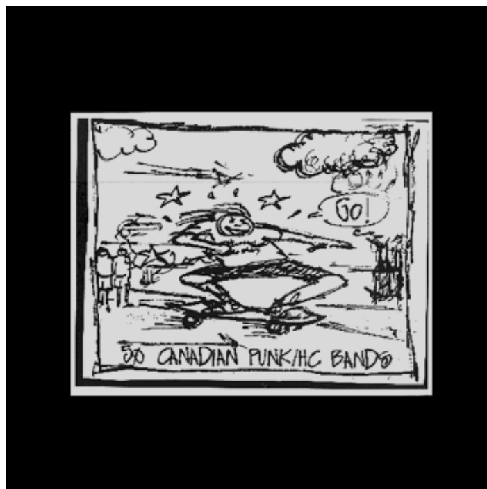
"GO!" compilation by Fans of Bad Productions Records. Released on LP in 1997, CD in 1998.

weren't ready in time, the band quickly put together 19 pre-release record covers, each were different, for that night.