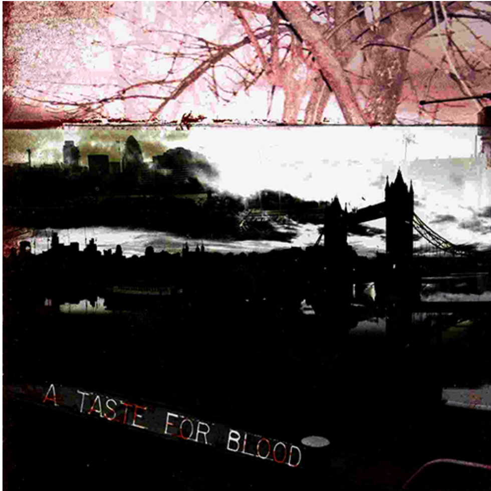
A Taste for Blood, self-titled EP, November 2003.