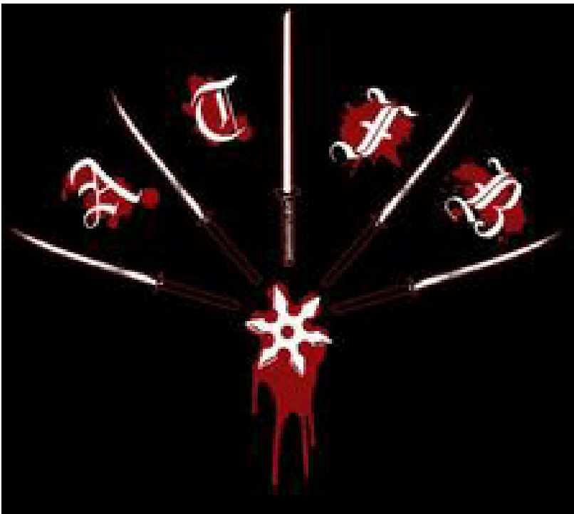
A Taste for Blood logo during the promo 2004 era.