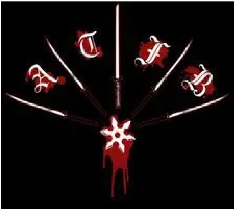
A Taste for Blood logo during the promo 2004 era.