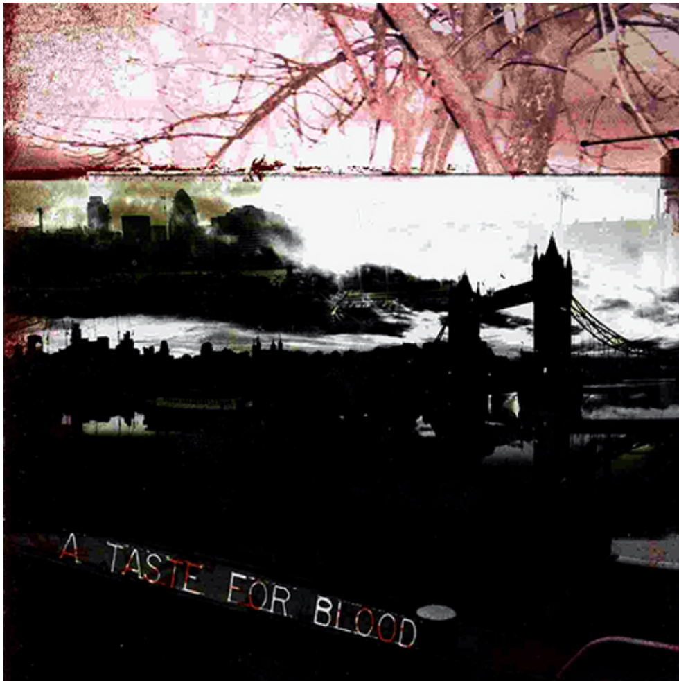
A Taste for Blood, self-titled EP, November 2003.