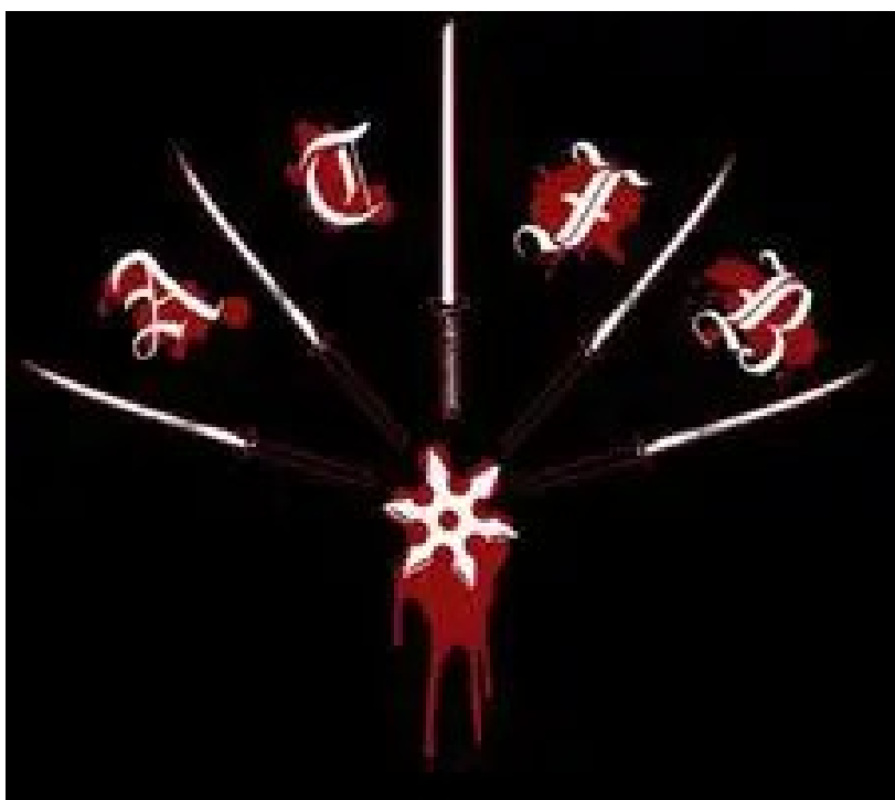
A Taste for Blood logo during the promo 2004 era.