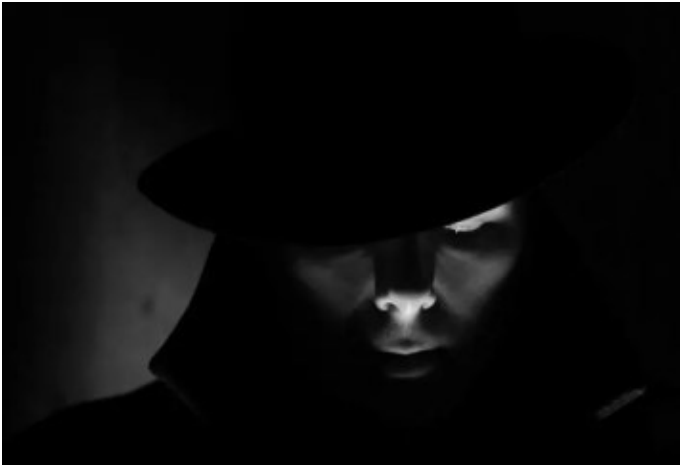
Promotional still for Soufferance's "Memories of a City".