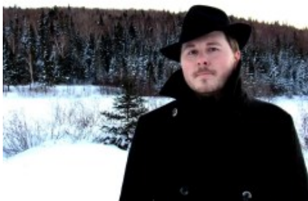
Vision Eternel photo shoot in Notre-Dame-