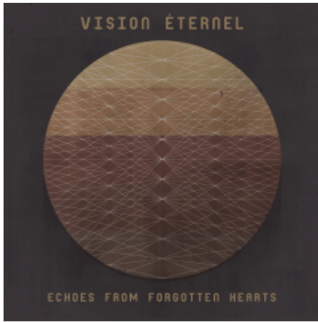
Vision Eternel "Echoes From Forgotten Hearts" EP. Released February 14th 2015 on Abridged Pause Recordings (APR11).