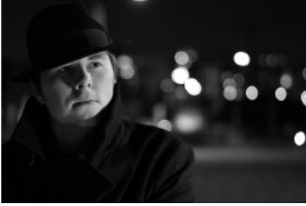
Vision Eternel photo shoot in Montreal. Photography by Jeremy Roux, 2010.