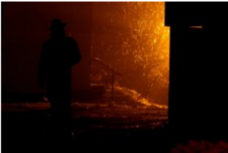
Vision Eternel photo shoot in Wexford.