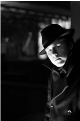
Vision Eternel photo shoot at Dalhousie Station, Montreal. Photography by Jeremy Roux, 2011.