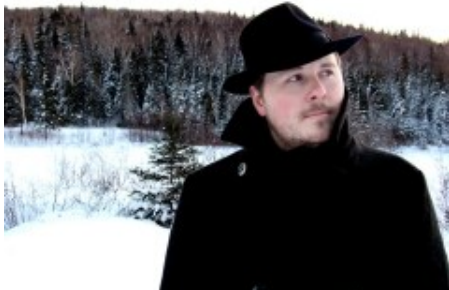
Vision Eternel photo shoot in Notre-Dame-de-la-Merci. Photography by Rain Frances, 2017.