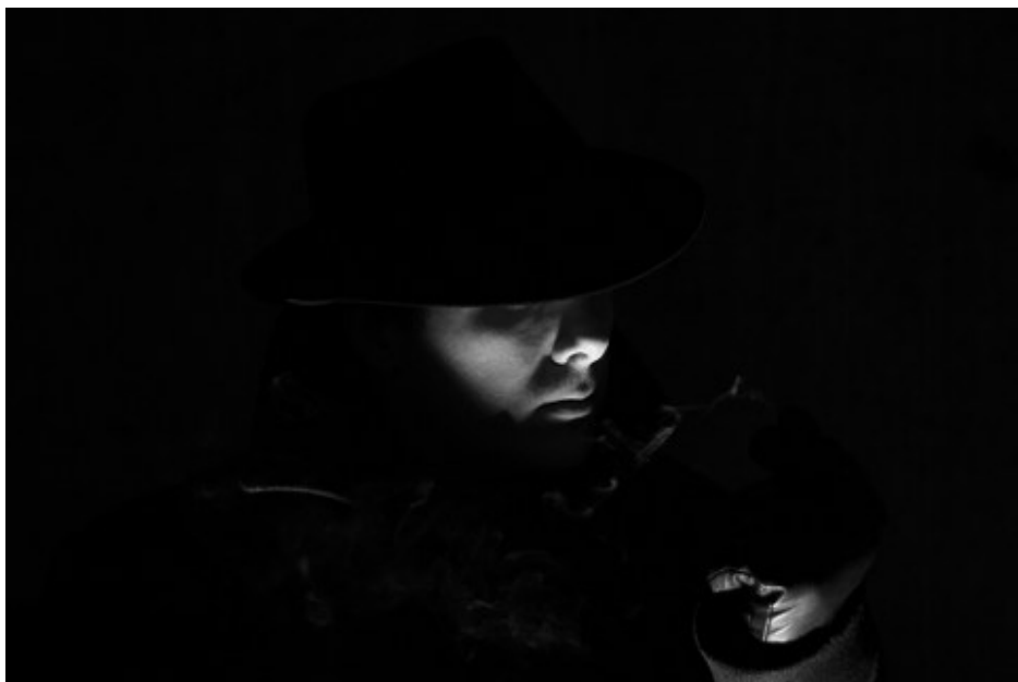
Vision Eternel photo shoot at Dalhousie Station, Montreal. Photography by Jeremy Roux, 2011.

managed to re-work two Vision Eternel songs into post-rock/indie rock-sounding material.