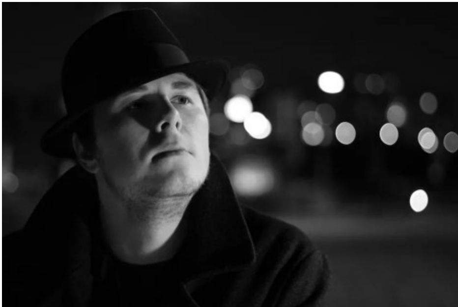
Vision Eternel photo shoot in Montreal.