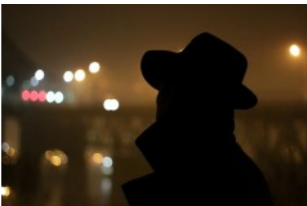
Vision Eternel photo shoot on Ile Sainte-