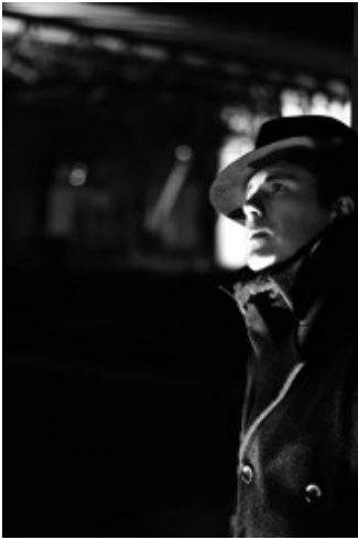
Vision Eternel photo shoot at Dalhousie Station, Montreal.