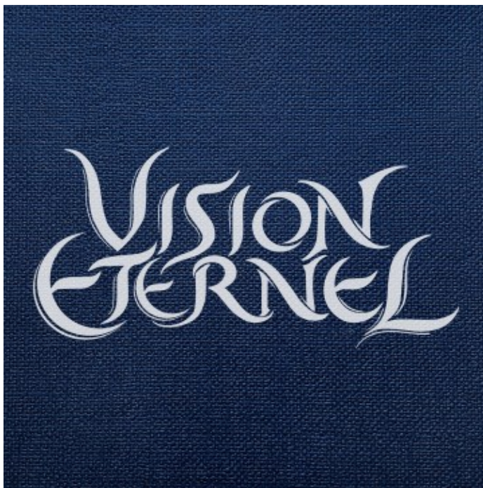
Vision Eternel “An Anthology Of Past Misfortunes” boxed set. Released April 2018 on Abridged Pause Recordings (APR14).