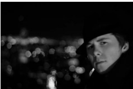
Vision Eternel photo shoot in Montreal.