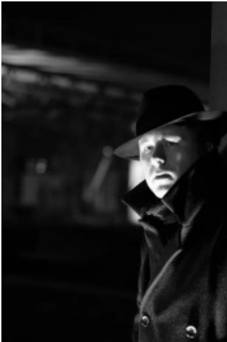
Vision Eternel photo shoot at Dalhousie Station, Montreal. Photography by Jeremy Roux, 2011.