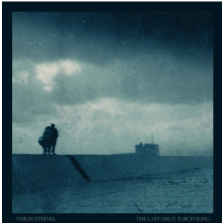
Vision Eternel "The Last Great Torch Song" EP. Released March 14th 2012 on Abridged Pause Recordings (APR6).