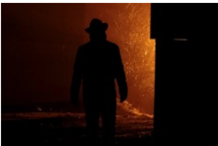
Vision Eternel photo shoot in Wexford. Photography by Rain Frances, 2015.