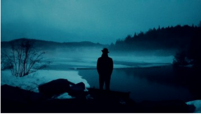
Vision Eternel photo shoot in Wexford.

Jeremy Roux's 2008 band logo and Christophe Szpajdel's 2017 anniversary logo. A new music video for the song " Pièce No. Trois ", originally released on " Echoes From Forgotten Hearts " was released in August. The band also shot two new promotional photo sets.