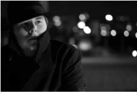
Vision Eternel photo shoot in Montreal. Photography by Jeremy Roux, 2010.