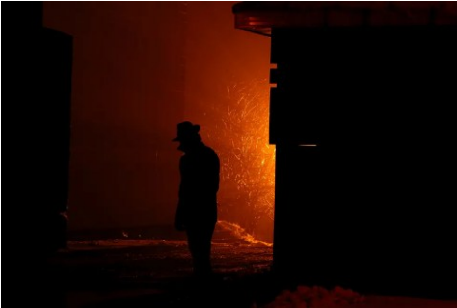
Vision Eternel photo shoot in Wexford. Photography by Rain Frances, 2015.