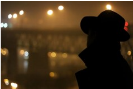
Vision Eternel photo shoot on Ile Sainte-Helene. Photography by Jeremy Roux, 2012.