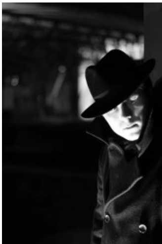
Vision Eternel photo shoot at Dalhousie Station, Montreal.

A music video was filmed for the single, " Love Within Narcosis " and was promoted exclusively on YouTube throughout the first half of 2007. A second single was released in the summer of 2007 for " Love Within Isolation ", and helped Vision Eternel peak on the independent Myspace charts; reaching No. 6 on the Shoegaze charts and No. 21 on the Ambient charts. To this day, " Seul Dans L'obsession " remains the best-selling and most downloaded release on Mortification Records.