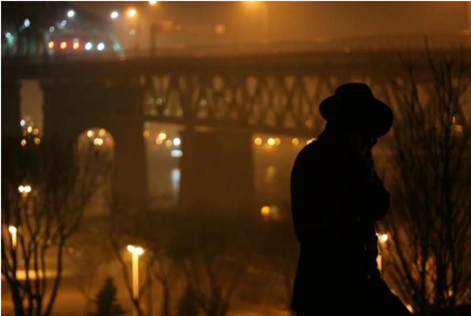
Vision Eternel photo shoot on Ile Sainte-Helene.