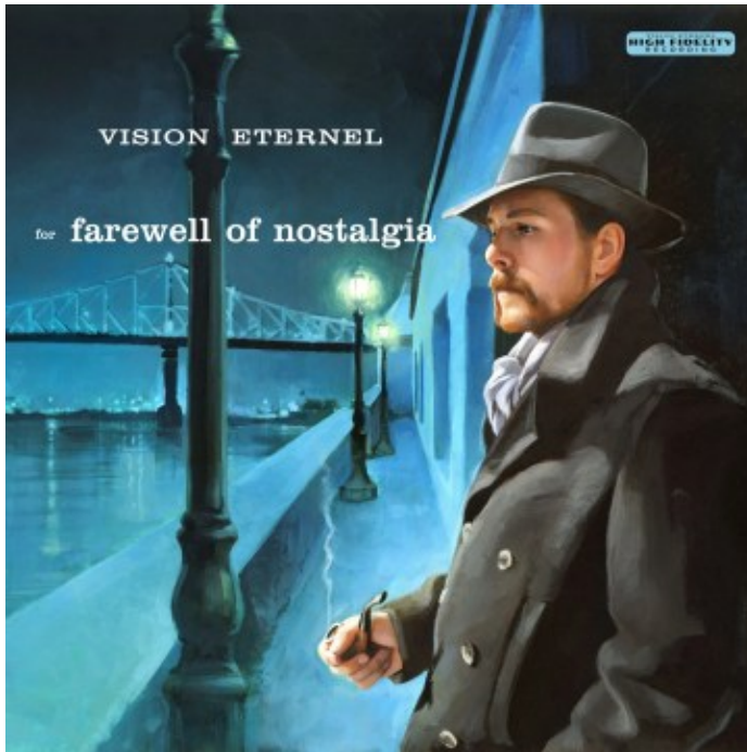
Vision Eternel – For Farewell Of Nostalgia