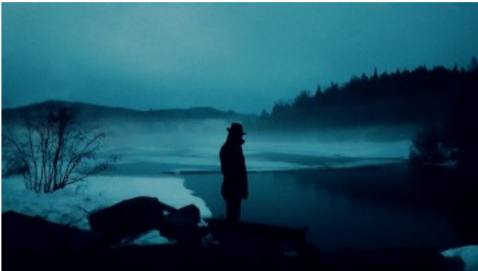
Vision Eternel photo shoot in Wexford.