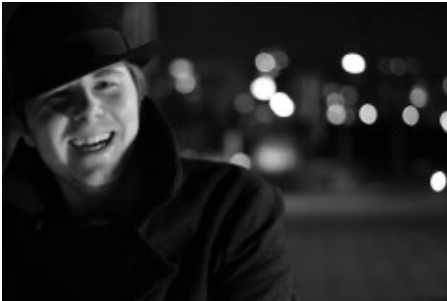
Vision Eternel photo shoot in Montreal. Photography by Jeremy Roux, 2010.