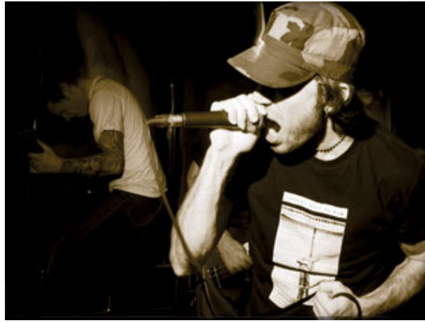
To the Lions, live