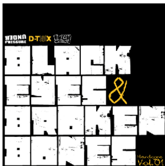
"Black Eyes and Broken Bones", Under Pressure Records, November 2006

tracking their new album. To the Lions were producing it themselves, which meant they were paying for it themselves too. It took the band four months of on and off recording to finish the album. Members were perfectionists but also had family lives, full time jobs and even house renovations to take care of, and this was a part-time band. The recording sessions had the band re-record every song from the demo except "Fallen", as they felt the song was too weak to keep, plus five new songs.