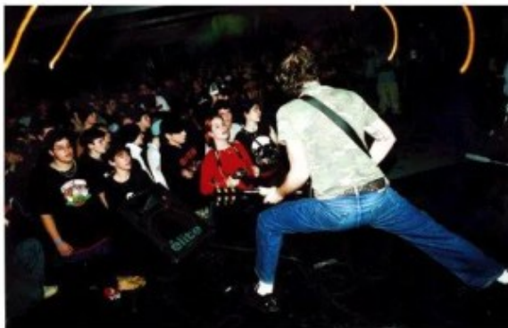
The Separation Suicide playing at L'Anti in Quebec City. Date and photographer unknown