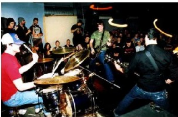
The Separation Suicide playing at L'Anti in Quebec City. Date and photographer unknown