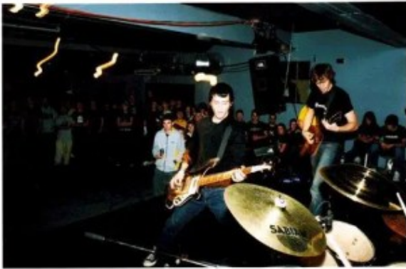
The Separation Suicide playing at L'Anti in Quebec City. Date and photographer unknown