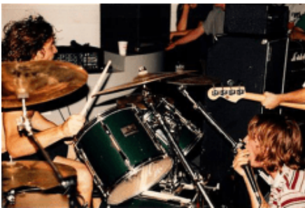
One Eyed God Prophecy performing on Long Island, New York.