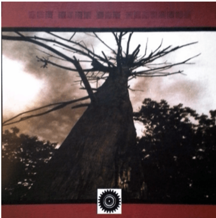
One Eyed God Prophecy 12" LP, first pressing on The Great American Steak Religion, 1996