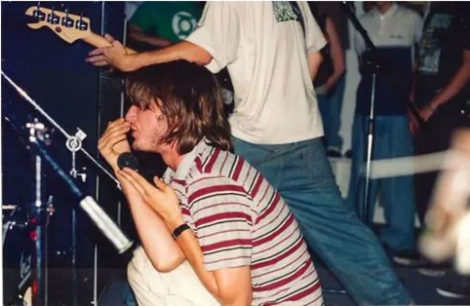
One Eyed God Prophecy performing on Long Island, New York.