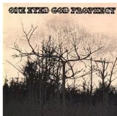
One Eyed God Prophecy discography CD

But One Eyed God Prophecy would break up shortly into 1997, just before hitting their two year mark as a band. The new songs were never finished nor recorded. They had done everything they could dream of. But all too fast; the band got too popular too fast, and ended too fast. Still to this day, people are talking about them.