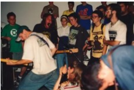
One Eyed God Prophecy performing on Long Island, New York.

This five-piece formed in 1995 and practiced in guitarist Ugo Desgreniers' shed, where they would also play their first