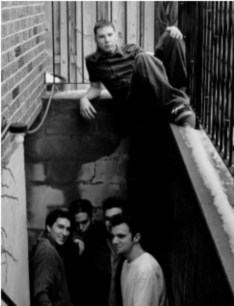
Louis Mistreated's first photoshoot, 1998-1999