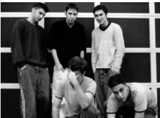
Louis Mistreated's second photoshoot, 2001