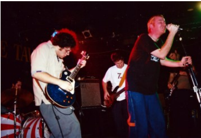
Louis Mistreated performing at the Horseshoe Tavern on January 23rd 2002, opening for The Gloria Record

2002 would feature less shows by the band but not less in quality. To start out the year, Louis Mistreated got to play with one of their hero, The Gloria Record, at the Horseshoe Tavern on January 23rd 2002. Although The Gloria Record was meant to be supported by Her Space Holiday during their first of three North American tours in 2002, the band couldn't make it across the border for the three Canadian shows. Leaving Louis Mistreated to open up directly for The Gloria Record! LM ended up partying with TGR backstage and garnered one of the only mention of any opening bands in Gloria Record's tour diary. They were asked to open up for The Gloria Record again