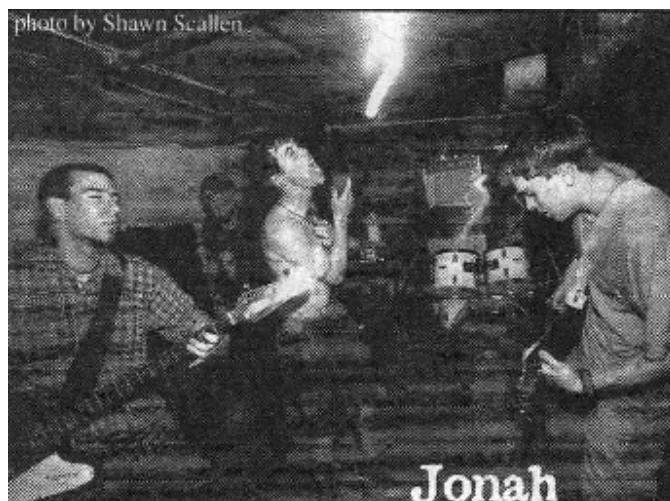
Jonah, circa 1996

Jonah was one the cult hardcore bands from Quebec in the mid 90s. They certainly hold their place in the top most important Quebec bands and I'm happy to finally shed some light on this gem.