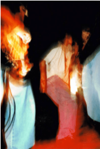
Avarice playing live in London, Ontario.