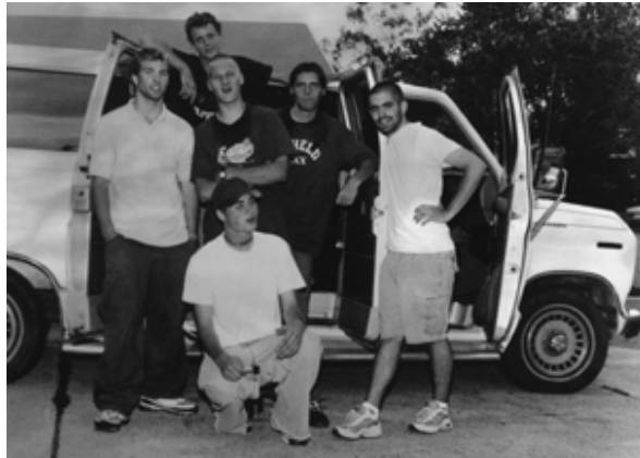
Avarice before a show.