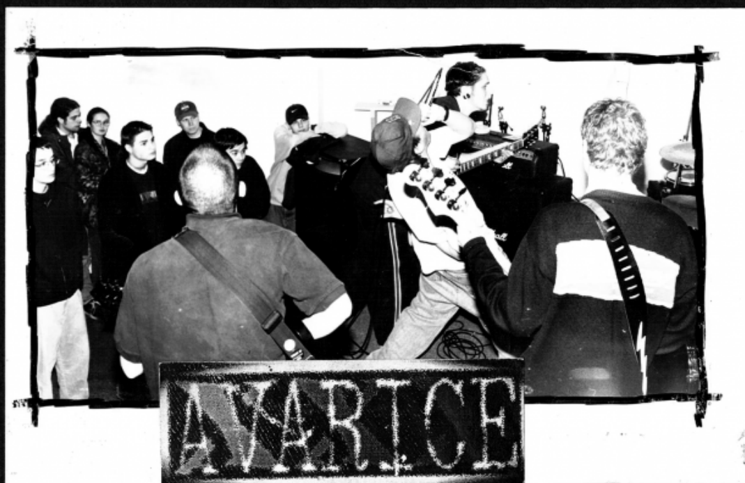
An Avarice sticker, made by the band on home printers