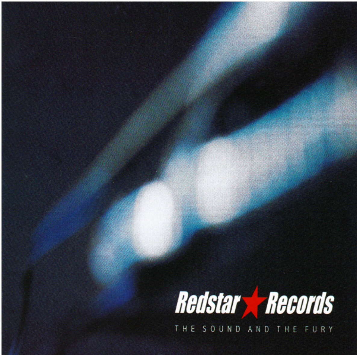
"The Sound and the Fury" compilation, Redstar Records October 1999